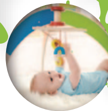
China HAPE toys for IKEA