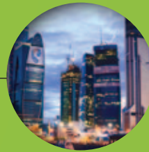
Russia Moscow City Business Center