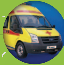
Russia ST Nizhegorodets light commercial vehicles