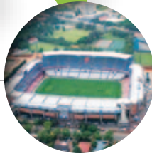
South Africa FIFA 2010 World Cup venues