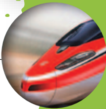
Italy Bellotti high-speed trains