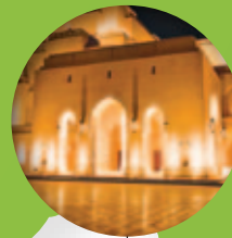
Oman Royal Opera Theater