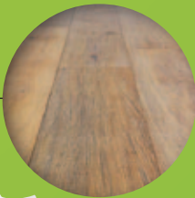
Italy Listone Giordano flooring