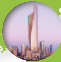
Kuwait Al Hamra Tower