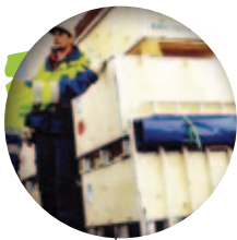
Sweden Nefab industrial packaging