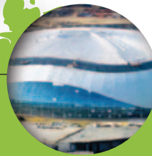
Russia Sochi 2014 Olympic venues