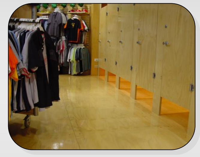
APPEARANCE FLOORING & PREMIUM DOORS - Add interest and appeal to any project by highlighting the natural characteristics of timber. F17 rated.