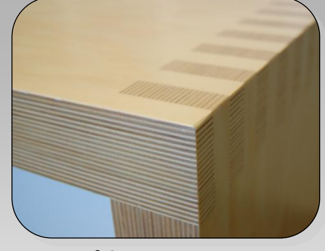
FURNITURE & CABINETRY — Feature the edge with our Multiply panels, manufactured with a uniform layered construction.