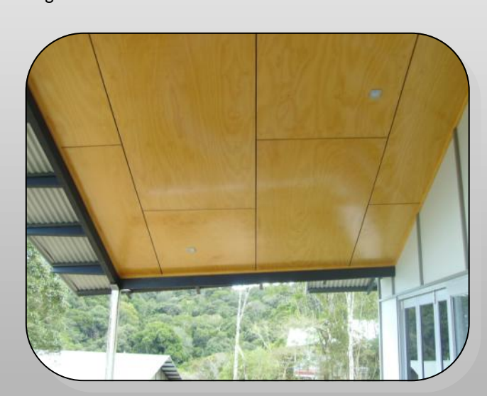
SEMI-EXPOSED — Make a feature of eaves and soffits using plywood designed for semi-exposed areas. Premium AC or Natural BB grades available.