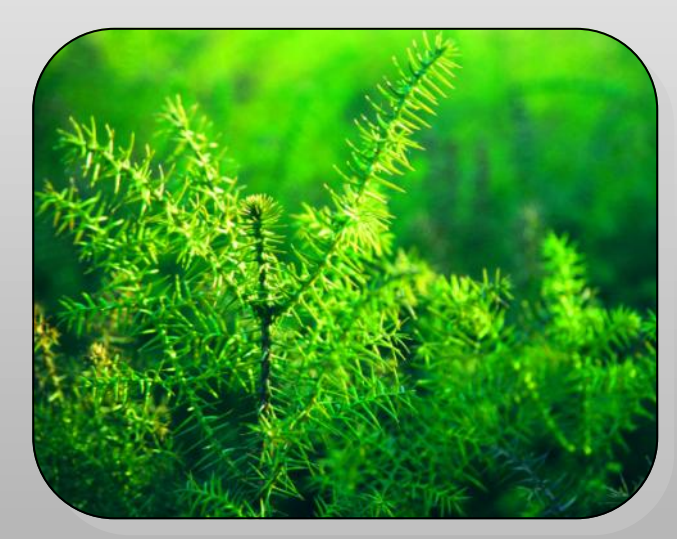
ENVIRONMENTAL — Super E0 plywood, AFS Chain of Custody certified. Timber credits for Green Star projects available.