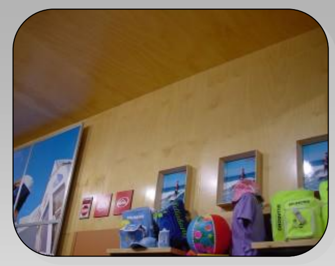
WALLS & CEILINGS — Available in Premium AC or Natural BB, with a range of finishes to simplify your fitout. Group 1, 2, 3 options also available.