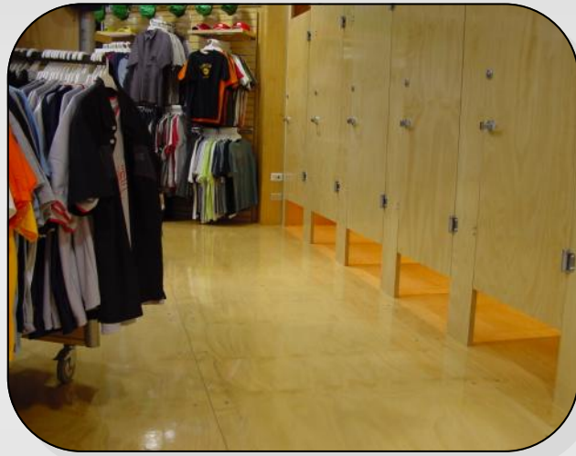
APPEARANCE FLOORING & PREMIUM DOORS — Add interest and appeal to any project by highlighting the natural characteristics of timber. F17 rated.