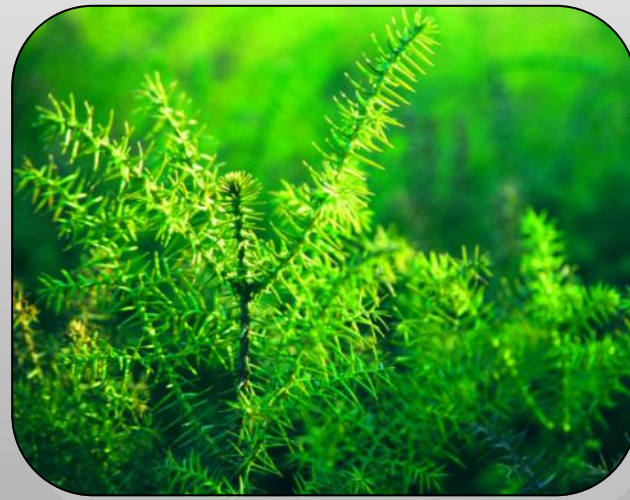
ENVIRONMENTAL — Super E0 plywood, AFS Chain of Custody certified. Timber credits for Green Star projects available.