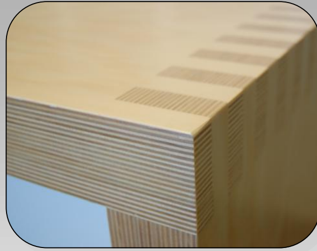
FURNITURE & CABINETS — Feature the edge with our Multiply panels, manufactured with a uniform layered construction.