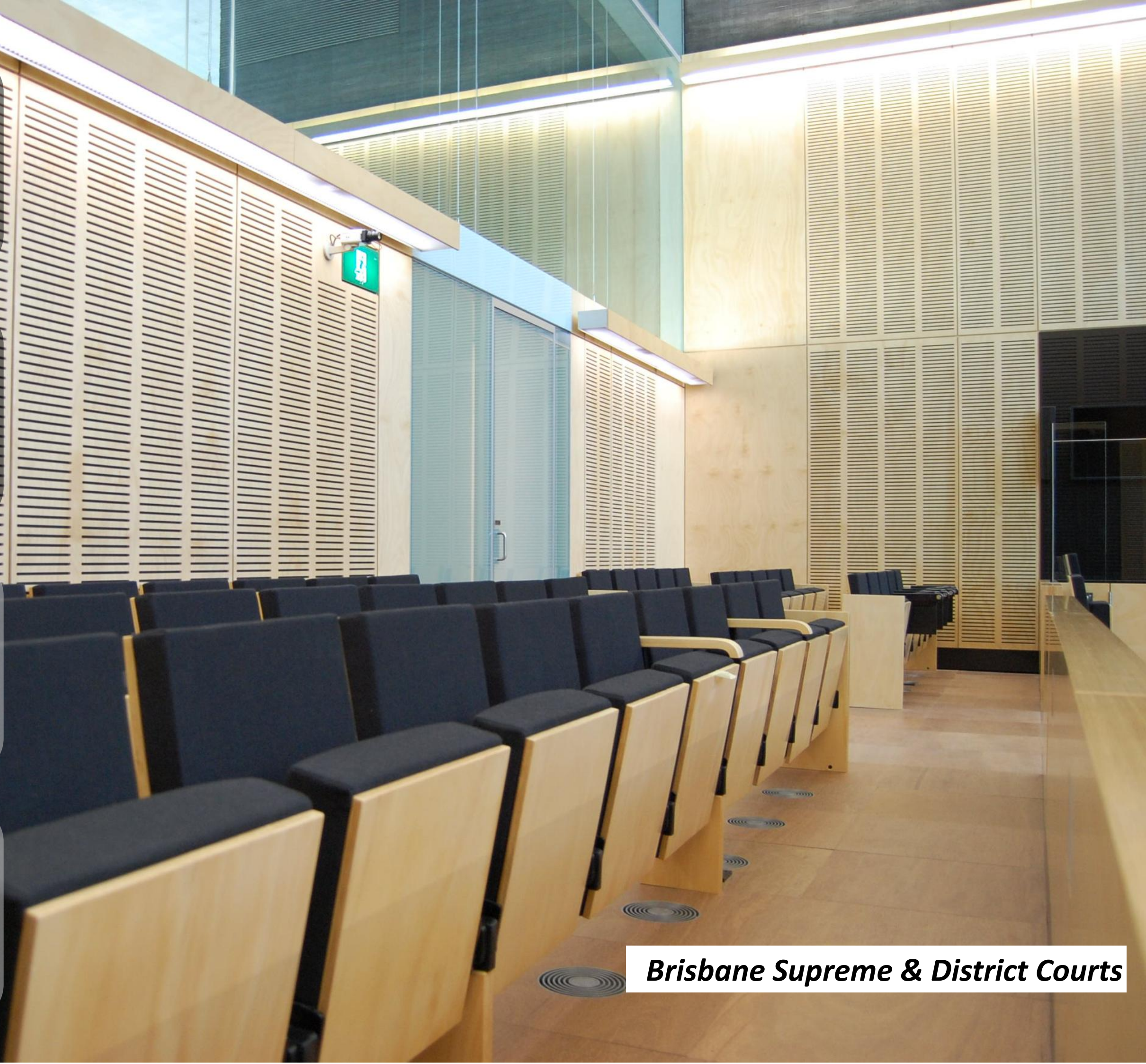
Brisbane Supreme & District Courts