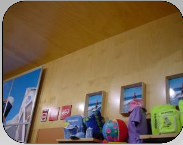
WALLS & CEILINGS — Available in Premium AC or Natural BB, with a range of finishes to simplify your fitout. Group 1, 2, 3 options also available.