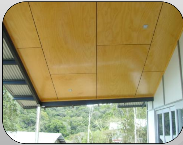
SEMI-EXPOSED — Make a feature of eaves and soffits using plywood designed for semi-exposed areas. Premium AC or Natural BB grades available.